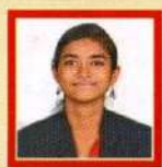
ABI.K INTELLIPAAT - IT 9 lakhs/annum