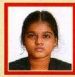
SOWMIYA.TN INTELLIPAAT - IT 9 lakhs/annum