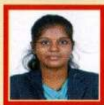
NANDHINI.B LAUNCHED- MBA 6 lakhs/annum