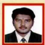
THILIP.G VEE TECH. - CSE 3 lakhs/annum