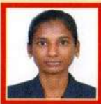
MAHALAKSHMI R ECON SYSTEMS - MCA 8 lakhs/annum