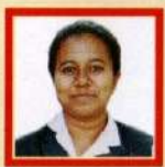
POORNIMA.K LAUNCHED- MBA 6 lakhs/annum